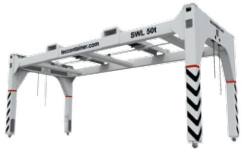
BA-030M Manual Frame