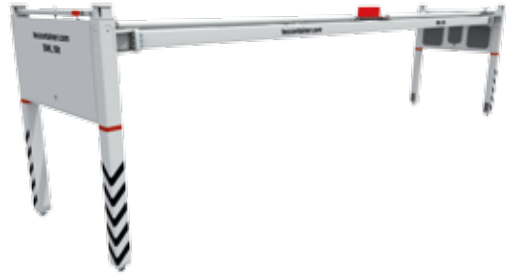
BA-030H Semi Automatic Frame